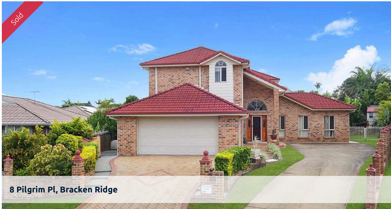
8 Pilgrim Pl, Bracken Ridge