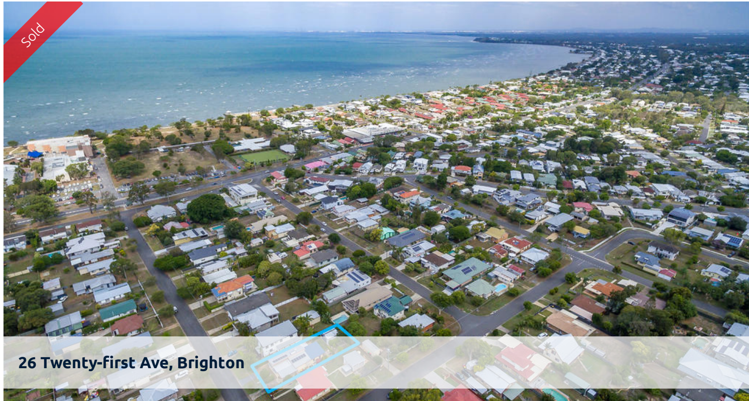
26 Twenty-first Ave, Brighton