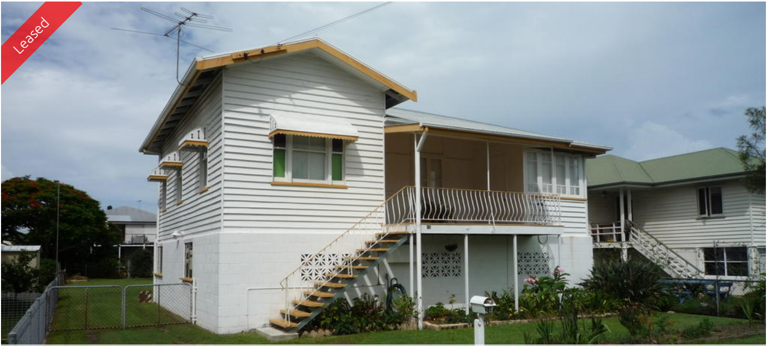
28 Sarah Street, Deagon