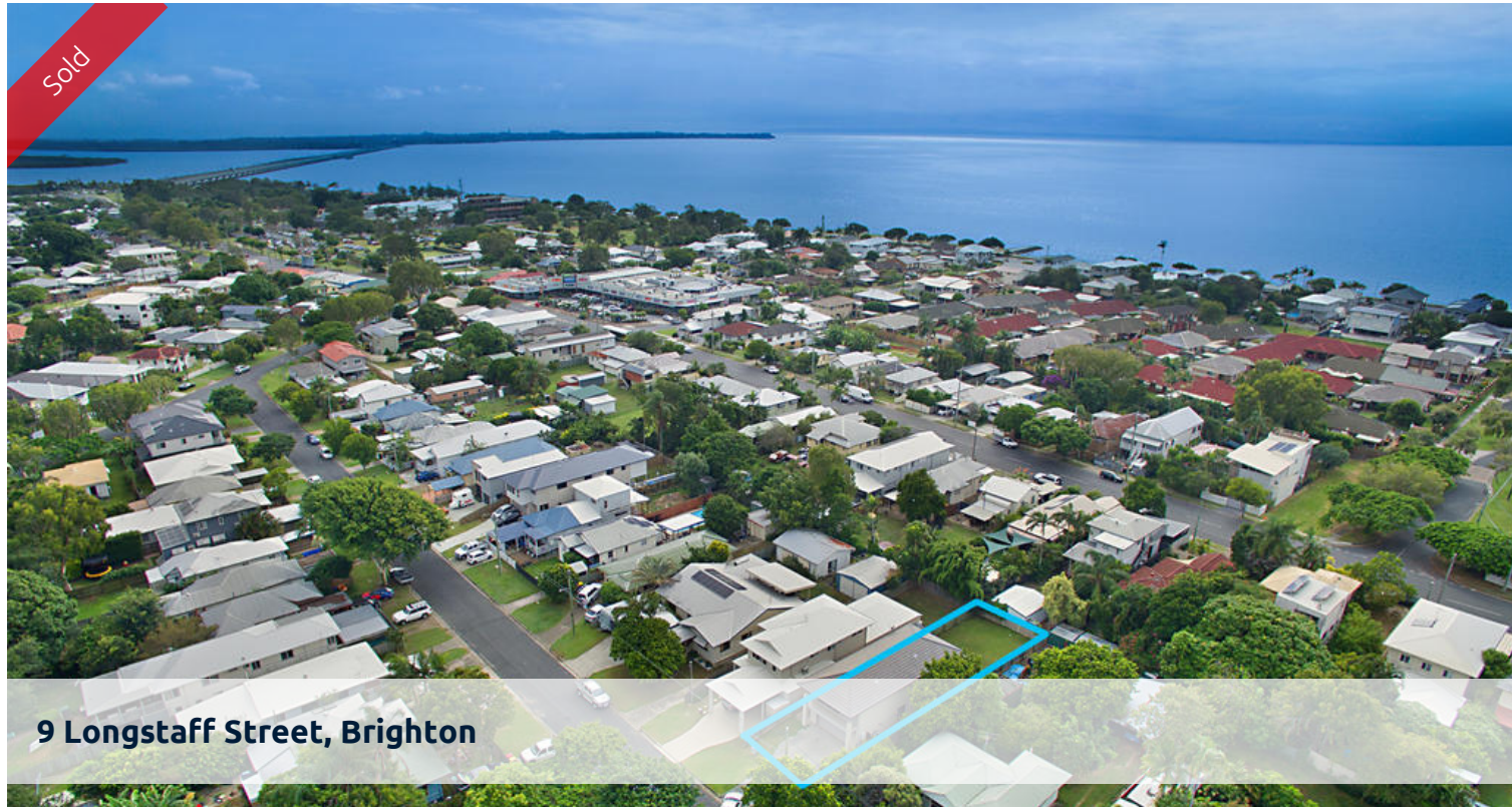
9 Longstaff Street, Brighton