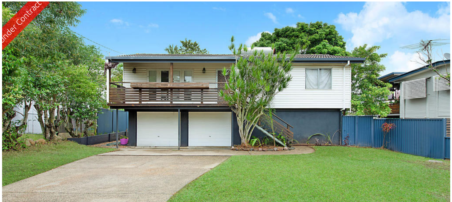
26 Pownall Cres, Margate