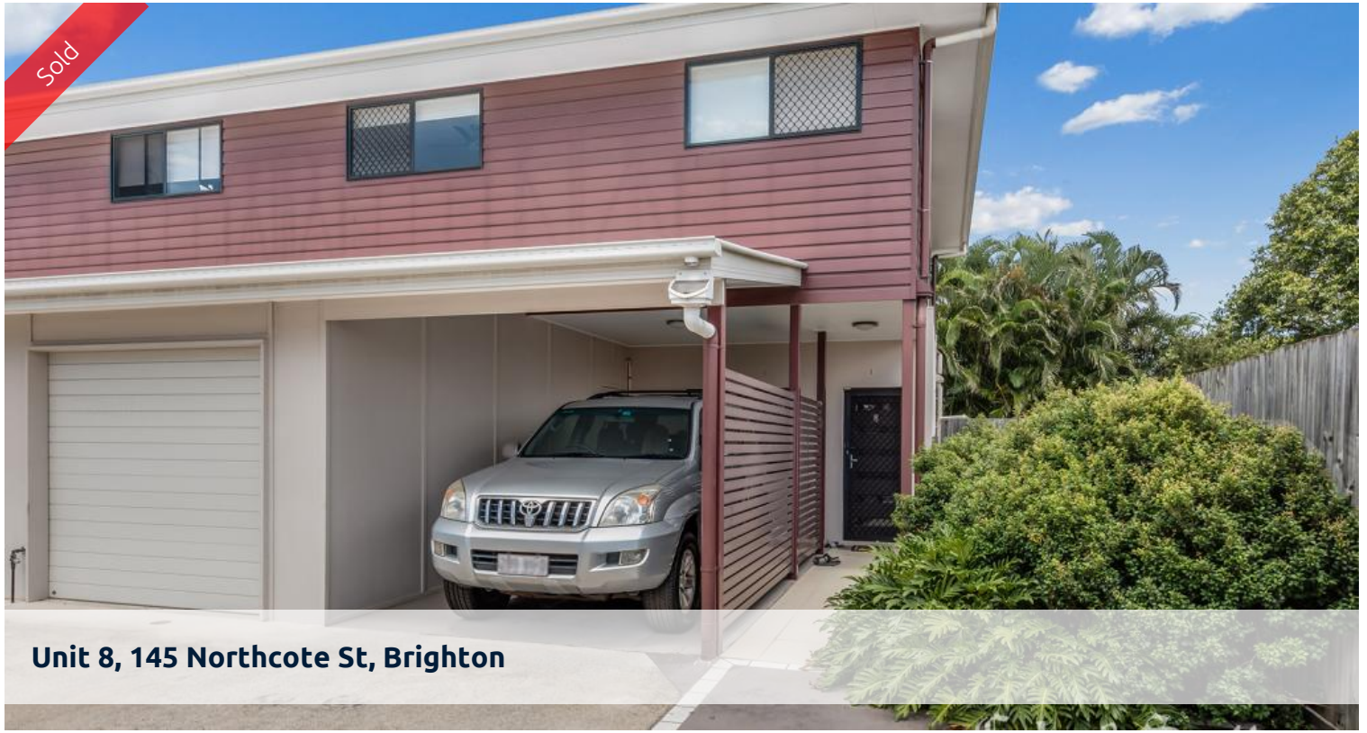
Unit 8, 145 Northcote St, Brighton