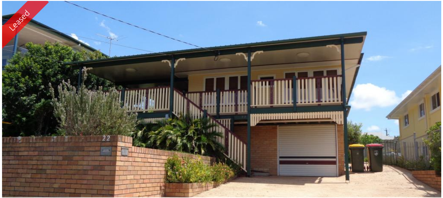
22 Gynther Avenue, Brighton