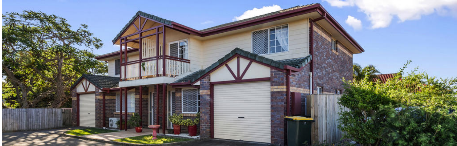
Unit 9, 24 Sixteenth Ave, Brighton