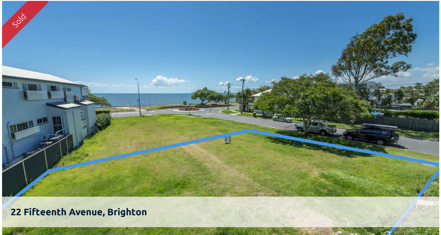
22 Fifteenth Avenue, Brighton